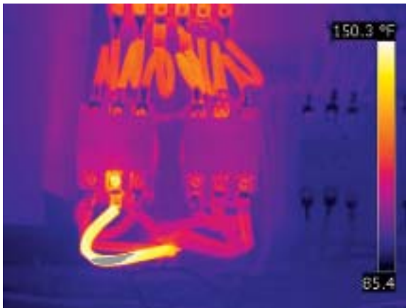
A closer look at these starter connections also reveal a significant hot spot with the bright yellow connector.

electrical equipment failure and breakdown are the leading causes of fires.